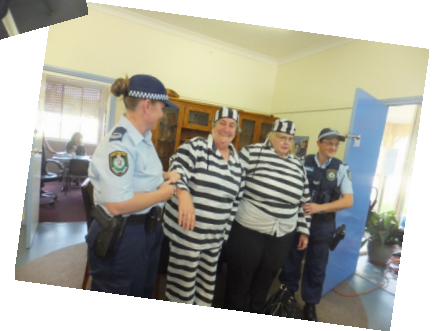
Blue Healers being locked up to raise money