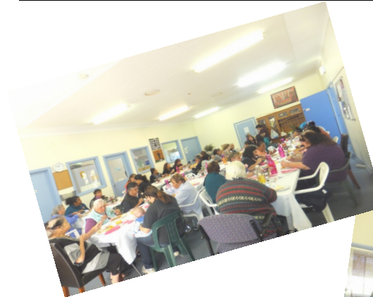
Mothers Day Lunch